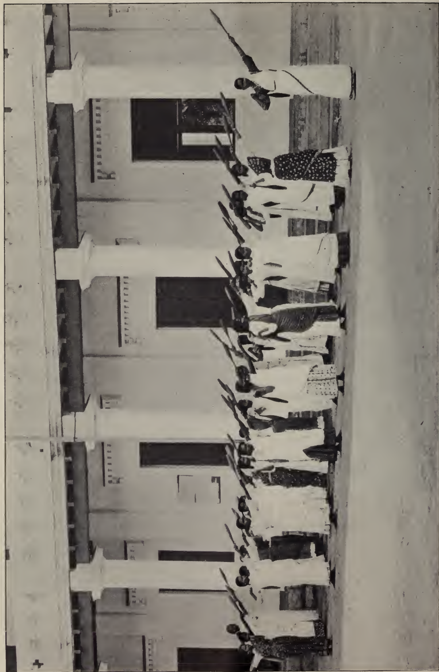
SCHOOLGIRLS AT MANGALAPURAM, MADURA. (See page 163.)